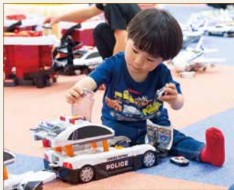
Left: Everything we do aims to put smiles on the faces of children. Right: The Bubble Blowing Elephant, which became popular worldwide (1957)

We continue to inherit the original passion of 11-year-old Eiichiro Tomiyama to create truly excellent quality products with play value for children all over the world with infinite possibilities for the future.