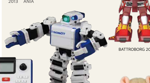
Omnibot 17µ i-SOBOT