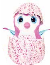
HATCHIMALS Umarete! Woomo