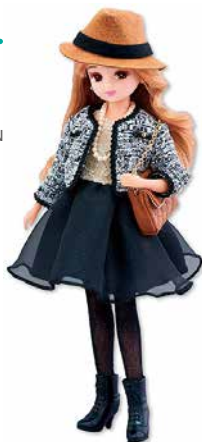
Licca Bijou Series