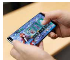
DUEL MASTERS PLAY'S