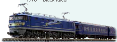
TOMIX Approved by East Japan Railway Company