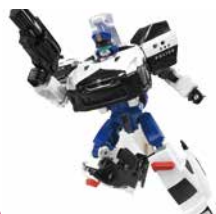
TOMICA Heroes Jobraver Specialy-equipped combined robot