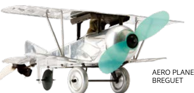
AERO PLANE BREGUET