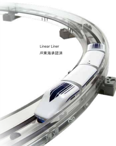
Linear Liner JR東海承認済