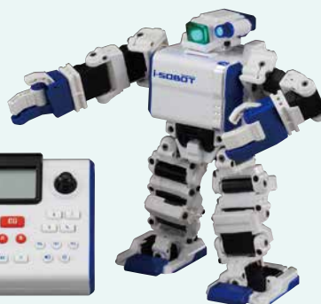
Omnibot 17μ i-SOBOT