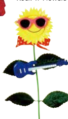
Rock 'n' Flowers