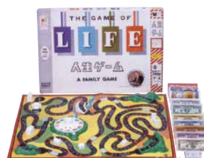
The Game of Life