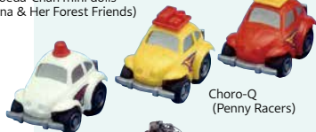
Choro-Q (Penny Racers)