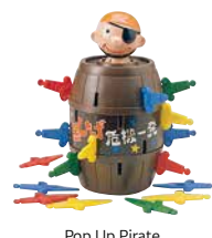
Pop Up Pirate