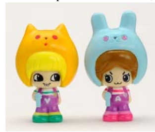
PUFFY, as fairies Yumi-chan (left) and Ami-chan (right) in the world of Koeda-chan .

"I loved Koeda-chan as a child and now, so many years later my dream of being her friend has come true." - Yumi