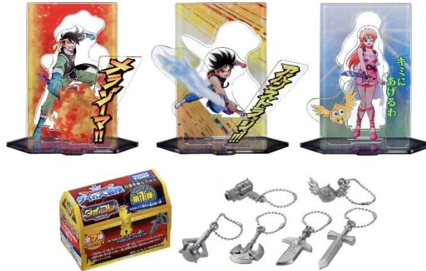
“DAICOLLE First Series” (front) and “Visual Figure” (back)

TOMY Company, Ltd. (Representative Director, President & COO: Kazuhiro Kojima, headquarters: Katsushika-ku, Tokyo) will release toys which reproduce the world of “DRAGON QUEST The Adventure of Dai” (*)1 , a new TV animation to be aired on broadcasting stations affiliated with TELEVISION TOKYO from Saturday, October 3, 2020, including “DAICOLLE First Series” (SRP: JPY 450/tax not included), and “Visual Figure” (4 types, SRP: from JPY 1,200/tax not included), on Saturday, October 24, 2020, at toy stores, toy sections of department stores/mass retailers, online shops, and TOMY Company’s official online store “Takara Tomy Mall” ( takaratomymall.jp ), etc.