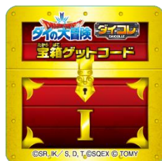
2D code on the back of the “Treasure Chest Get Code” is linked to the game