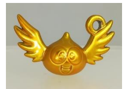
You will get “Golden Gomechan” if a lucky card is enclosed