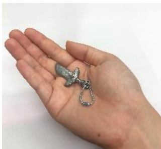
Palm-sized weapons and items