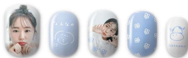
Design example: Printing photos of naenano