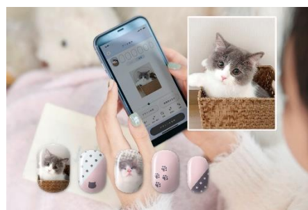
Design example: Printing photos of a cat