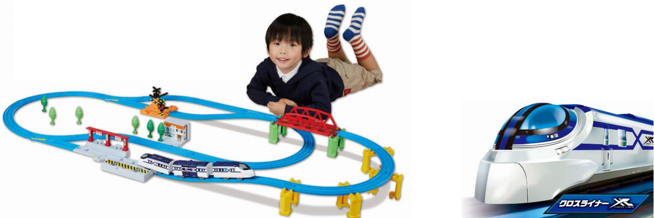
(Left) “Make you excited! PLARAIL BEST SELECTION SET”