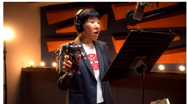
TRANSFORMERS “Rise of the Beasts: Rise of the Beasts Optimus Primal” Second commercial for the “Transformers: Rise of the Beasts” toy series