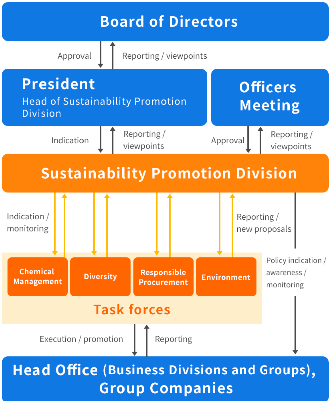
[Chart of Sustainability and CSR Governance System]