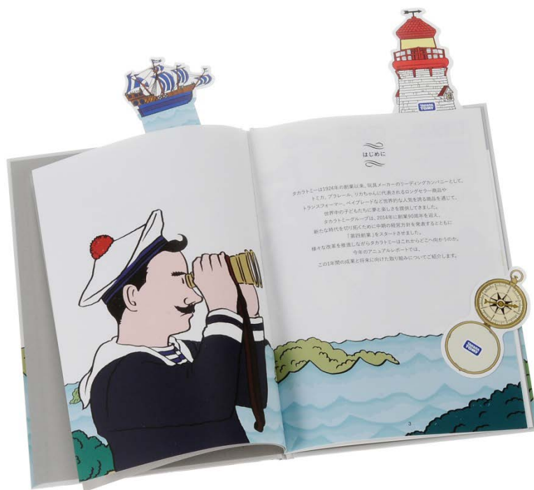
(*1) Special edition: The illustrated hard cover editions of Tomy’s annual report featuring specially made bookmarks.