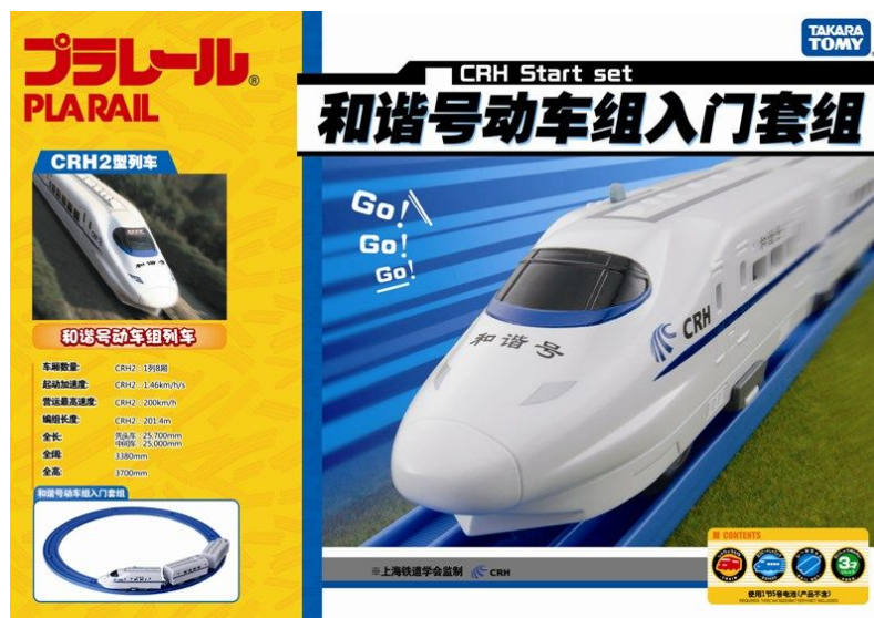
Plarail 'CRH2 Hexiehao Starter Set' packaging

Price: CNY 99 (CNY 1 = approximately JPY 13 as of April 23rd, 2010) Release Date: June 1st, 2010 (Children's Day) Contents: Chinese CRH2 Hexiehao Shinkansen (1 front car, 1 middle car, 1 rear car), curved track (8) Batteries: 1 AA battery (sold separately) Dimensions: Packaging W300 x H210 x D85mm Target Age: 3 years old and above Sales Channels: Shanghai Expo venue, nationwide toy stores, department stores, toy departments of hypermarkets