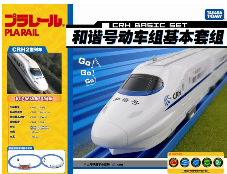
Plarail 'CRH2 Hexiehao Basic Set' packaging

Price: CNY 199 (CNY 1 = approximately JPY 13 as of April 23rd, 2010) Release Date: May 1st, 2010 (commencement date of Shanghai Expo) Contents: Chinese CRH2 Hexiehao Shinkansen (1 front car, 1 middle car, 1 rear car), straight track (1), curved track (12), Y point track (1 left, 1 right), city train station (1), tree (1), signal light (1) Batteries: 1 AA battery (sold separately) Dimensions: Packaging W410 x H310 x D110mm Target Age: 3 years old and above Sales Channels: Shanghai Expo venue, nationwide toy stores, department stores, toy departments of supermarkets