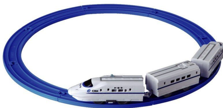
Plarail 'CRH2 Hexiehao Starter Set' product contents

(C) Shanghai Railway Society, CRH. (C) TOMY. 'Plarail' is a registered trademark of TOMY Company, Ltd.