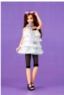
Airy Cut Shion (Princess Style)

Product Names: Exte-Change Jenny; Airy Cut Shion; Kira Cawa Deco Ayano; Yuru Fuwa Curl Jessica; Pop Color Mirai SRP: SRP JPY 3,990, incl. 5% Japan consumption tax Date on Sale in Japan: September 16, 2010 Recommended Age: 6 years + Sales Channels: Department Stores, toy retailers and other major retailers nation-wide Copyright: © TOMY