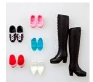
Shoes Set 6-pair set SRP JPY 1,260