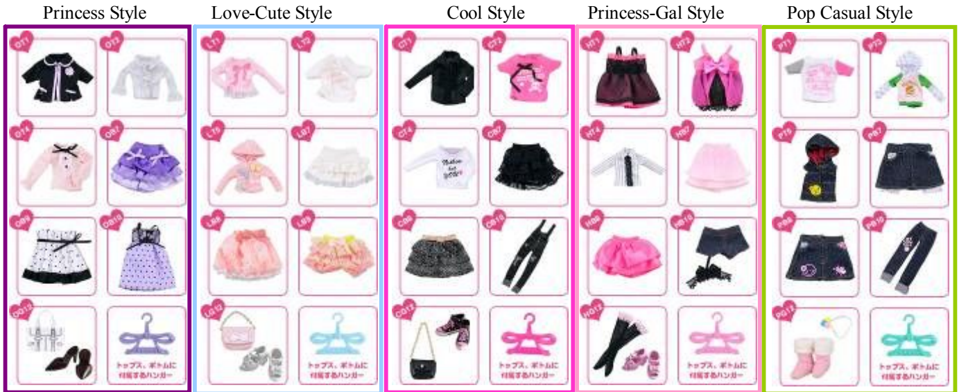
Shown above are the first 35 “Wear box” items launching in September. Each item comes with its own hanger. (SRP JPY 630).