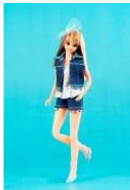
Pop Color Mirai (Pop Casual Style)