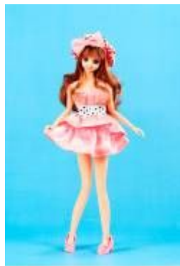
Kira Cawa Deco Ayano (Love-Cute Style)