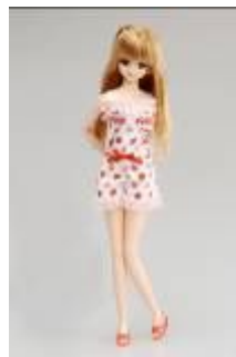
“Jenny in Room Wear”