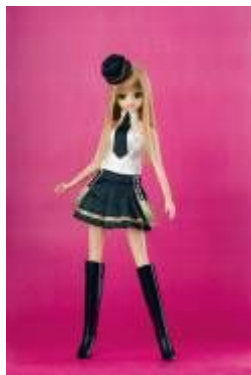
Exte-Change Jenny (Cool Style)