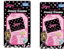
Cosmetics (for use on dolls) SRP JPY 630

5 varieties, doll not included, SRP JPY 2,100