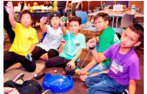
Bladers enjoying playing Beyblade after the Asia Championship!