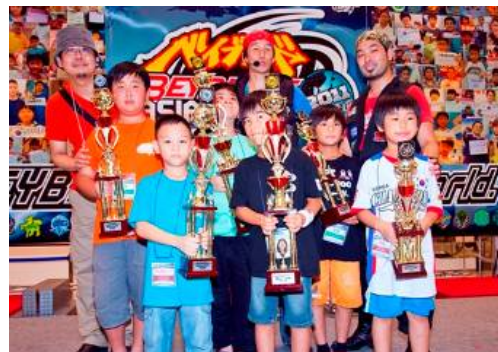
The Champions: Front, L-R: Junior Class, Singapore, Japan, Republic of Korea Back, L-R: Regular Class, Taiwan, Indonesia, Japan