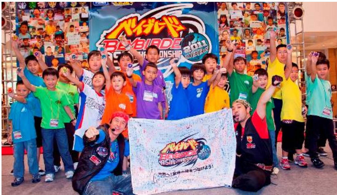
All the national representatives show their favorite Beyblade tops while standing in front of the message flag, inscribed with messages to all Bladers of Japan from each national representative.