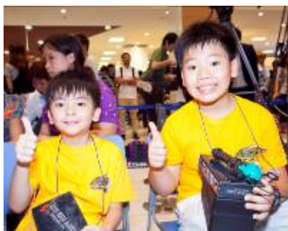
Viet Nam Bladers are ready for battle!!