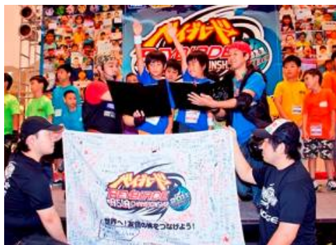
Japan representatives taking their oath in front of participants

In the opening ceremony, a message flag was introduced on which Bladers representing the other countries wrote their own personal messages to all Bladers of Japan. This was just another way for Beyblade to create bonds of friendship across borders and languages. After that, the Japanese representatives read the “ Beyblade Bond of Friendship Proclamation” which promoted one of the goals of the event, to establish bridge building bonds among the children, their parents and their international competitors.