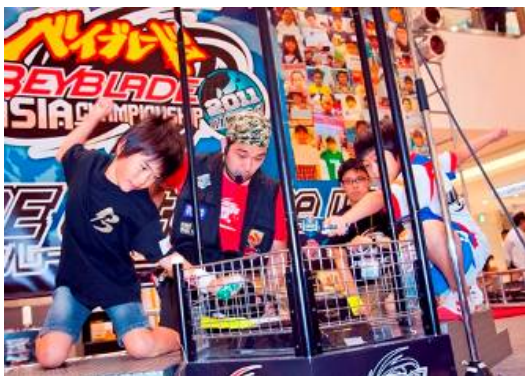
An Intense Beyblade battle Junior Class semifinal: Japan vs. Republic of Korea