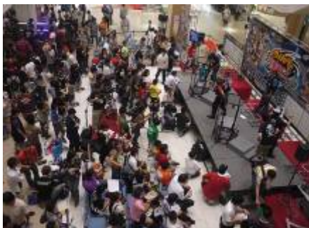
Spectators crowd the battle stage as families watched their child's battles eagerly.