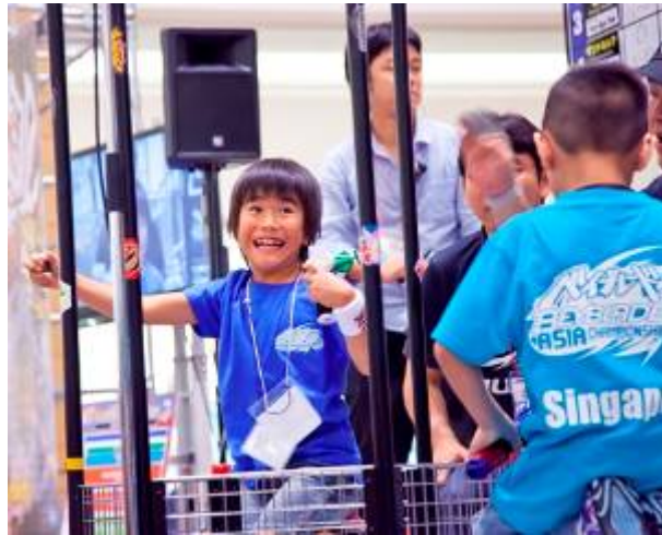
A Victory Smile Junior Class elimination: Japan vs. Singapore