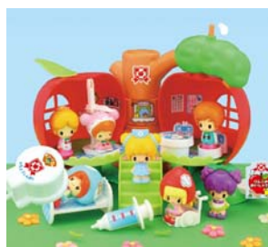
The Hospital set shown with various mini-figure dolls (Mini-figure dolls are each sold separately).