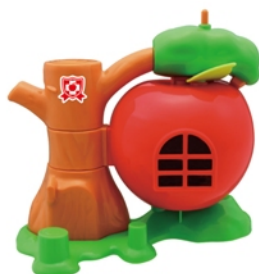
Koeda-chan No Ringo No Oisha-san (Koeda-chan's Apple Hospital)

The new Koeda-chan No Ringo No Oisha-san (Koeda-chan's Apple Hospital) is 18cm tall and apple-shaped with a medical theme. With the press of a switch at the top, the "apple" opens into two halves, instantly transforming the apple into a mini two-room hospital with stairs up the middle. The included accessories consist of a bed, a height and weight scale, a stethoscope, a syringe, a wheelchair etc. The stethoscope includes a fun roulette type gimmick which when pressed, shows one of four conditions: "Caught a cold," "Injury," "Stomach ache" or "Healthy." Other items included on cards or stickers for doctor & nurse role playing include a thermometer, medicine, a patient's registration card, pills and bandages. Sick patients can be carried to the bed in a wheelchair, diagnosed and given medicine or many other types of pretend medical care, introducing children to the importance of health and simply caring for others through fun hospital play.