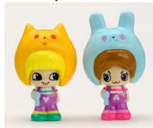
PUFFY, as fairies Yumi-chan (left) and Ami-chan (right) in the world of Koeda-chan .

"I loved Koeda-chan as a child and now, so many years later my dream of being her friend has come true." - Yumi