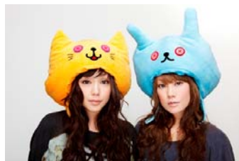
PUFFY

The superstar pop/rock duo Ami Onuki and Yumi Yoshimura, who are known collectively as PUFFY 3 , are self-proclaimed "huge fans" of Koeda-chan . The duo is celebrating its 15 th anniversary this year, but also has another milestone to celebrate: The two will get their own characters in the world of Koeda-chan ! They are already famous for their music, fashion, and entertaining performances both in Japan and internationally and they are also symbolic of Japan's kawaii (cute) culture. Now they get a chance to expand their presence by becoming the "singing fairies" " Ami-chan " and " Yumi-chan " in the imaginary world of Koeda-chan ! They even contributed their own ideas to the design of their characters. The "singing fairy" characters Ami-chan and Yumi-chan will be launched as part of the Koeda-chan No Ki No Uchi series in Japan in October 27 th , 2011. The SRP for these items is JPY 997, incl. 5% Japan consumption tax.