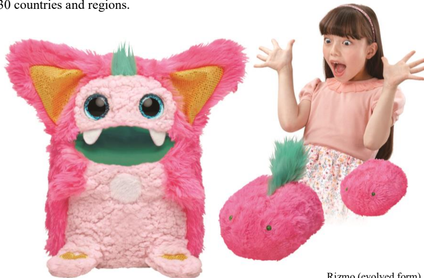
Rizmo (evolved form)