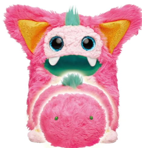
Image of the evolved Rizmo