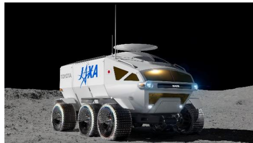
JAXA-Toyota manned, pressurized lunar rover (A conceptual image of the actual vehicle)

*1) This is tomica Netz Hyogo 86BS Toyota 86, which is competing in TOYOTA GAZOO Racing 86/BRZ Race 2019.