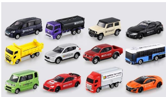
Tokyo Motor Show 2019 Commemorative Tomica Models

Besides Tomica, TOMY Company will introduce a wide variety of content at this year’s Tokyo Motor Show, arranging sections for Licca dolls, PAW Patrol, GSTREAM and Transformers in the Tomica Booth.