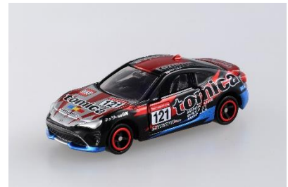
tomica Netz Hyogo 86BS Toyota 86 Price: JPY 880 (tax included) * Presales at the Tokyo Motor Show

* Prices including tax are stated for the above four products to correspond with their selling