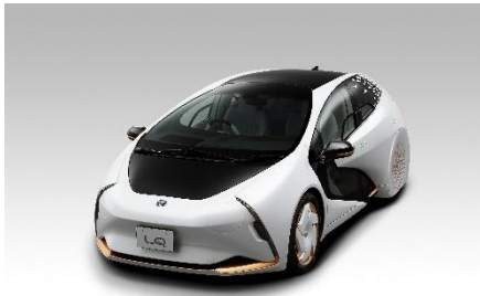
Toyota LQ (An image of the actual vehicle)

* Tomica mini-cars other than those included in the package are sold separately. * Items other than those comprising the set are sold separately. * Beams and tracks are images for illustration purposes only.