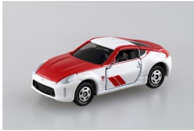
Nissan Fairlady Z 50th Anniversary Price: JPY 770 (tax included) * Presales at the Tokyo Motor Show