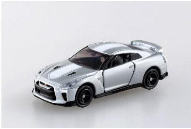
Nissan GT-R 50th Anniversary Price: JPY 770 (tax included) * Presales at the Tokyo Motor