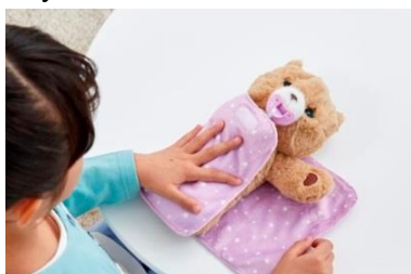
Swaddle in a blanket before sleeping

"Dakkosite Nerun (Cozy Dozy)" does not immediately fall asleep even when gently laid down. Like real babies, it often wakes up just after it seems to have fallen asleep. Please play together by talking to your children, "Shall we try putting Nerun (Cozy Dozy) to bed?" "How can we get Nerun (Cozy Dozy) to sleep?", etc. While it is thought to have fallen asleep... turns out it is still awake... Therefore, children will be able to enjoy trying to put it to bed this way and that, such as by "reading picture books" and "singing lullabies" to it. Furthermore, parents will also think sweet the way their children take care of Nerun (Cozy Dozy) with all their might. It is a plush toy which parents and their children can go crazy about.