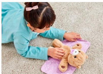
Laughs happily when tickled the stomach