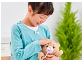
Giggles when patted on the head