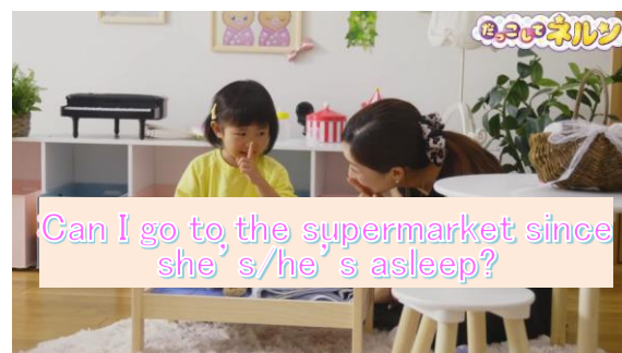
Do just like mom does...

TOMY Company celebrated the 95th anniversary of its founding on February 2, 2019