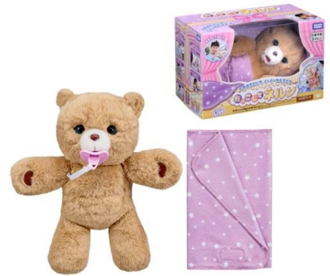
Dakkosite Nerun (Cozy Dozy) Cookie Bear

Website: www.takaratomy.co.jp/products/nerun/