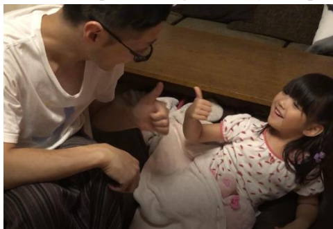
Putting Nerun (Cozy Dozy) to bed was a success!

Super Daddies were asked to take videos at home on how they tried to “put Nerun (Cozy Dozy) to bed with their children.” Scenes of how dads and their children enjoyed “putting Nerun (Cozy Dozy) to bed” by communicating could be seen. Dads encouraged their children by calling out, “See if you can put Nerun (Cozy Dozy) to bed,” “Shall we put the blanket on?” “Why not try sleeping together?” “How can we close its eyes (have it fall asleep)?” “Looks sleepy,” “Oh, it woke up,” etc. Together they also patted the head, calling out “Shhh!” to be quiet.