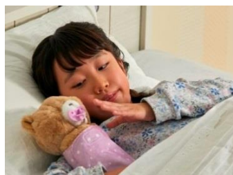
Falls asleep when it is gently laid down with a pacifier popped into its mouth