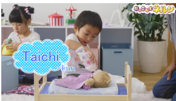
Try giving milk...

The way children freely play were monitored in a separate room and the situation was secretly videotaped. They enjoyed taking care in various ways such as tickling, patting the head, playing the piano, reading aloud a picture book, giving milk, and brushing the body. Children would say, “Shhh! She’s/He’s sleeping,” asking everyone to be quiet, and put Nerun (Cozy Dozy) to bed by gently tapping. After a success sleep, some would imitate their mother and say, “Can I go to the supermarket now that she’s/he’s asleep?” Such heartwarming scenes were seen where children completely took on the role of a parent when “putting Nerun (Cozy Dozy) to bed.”