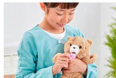
Sucks when a pacifier is popped into its mouth