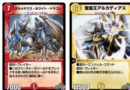
Classical legendary cards (app version)