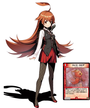
Game navigator “Cocco Lupico”