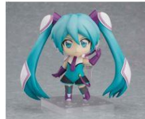
Nendoroid Miku Hatsune (on sale in August 2019) Maker: Good Smile Company, Inc.