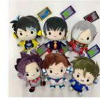
Stuffed toy mascots (with Shinca Plate) (on sale in June 2019) Maker: TBS GLOWDIA, Inc.