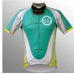
Cycling jersey shirt (ESHAYABUSA MkiVer.) (on sale in March 2020) Maker: Aurora