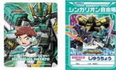
Notebook (on sale in December 2018) Mini puzzle collection (on sale in May 2019) Erasers (on sale in April 2018) Maker: SHOWA NOTE CO.,LTD..