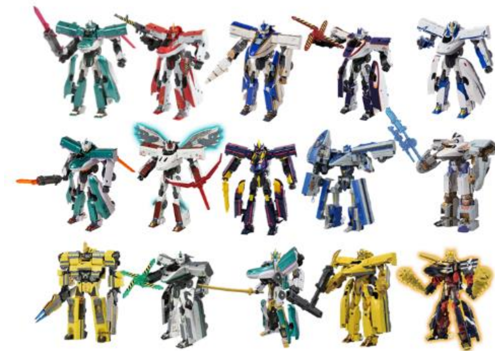
Part of Deluxe Shinkalion Series products released in the past

In “PLARAIL SHINKALION,” 24 items including reproduced versions have been released since its launch in December 2017.