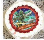
SHINKALION Christmas Pri Cake (on sale in December 13, 2019) Maker: EITSU