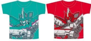
"SHINKALION" X OJCO collaboration T-shirts "SHINKALION ESHAYABUSA" "SHINKALION E6KOMACHI" (on sale in April 2018) (on sale in December 13, 2019) Maker: channel H co., Ltd.

For SHINKALION, licensed merchandise other than toys have also been developed in various genres, which are sold by 100 or more licensees. (as of June 2020)