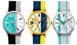
Watches in cans (on sale from December 2019) Maker: TBS GLOWDIA, Inc.