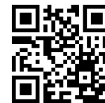
Commemorating the launch of a new model Original Animation

The “PLARAIL DXS SHINKALION N 7 0 0 S NOZOMI” is a character designed in the motif of the latest “N 7 0 0 S Shinkansen Nozomi,” the first full model change since the N 7 0 0 series, which commenced service from July 1, 2020. It incorporates the features of Central Japan Railway Company (JR Central)’s “N 7 0 0 S Shinkansen Nozomi” into the product design and character settings of SHINKALION, such as the “self-propelled battery device” and “plug socket for mobile