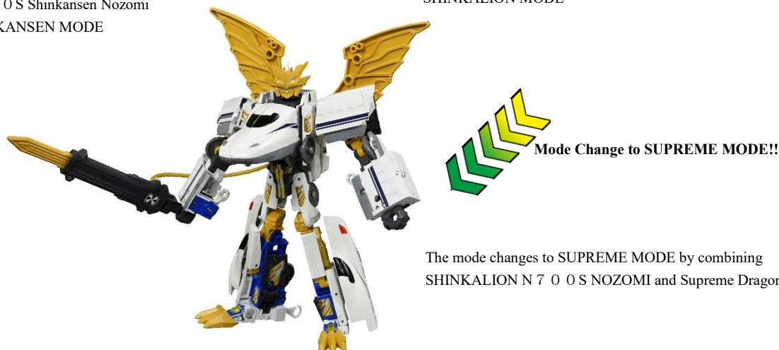
SHINKALION N 7 0 0 S NOZOMI