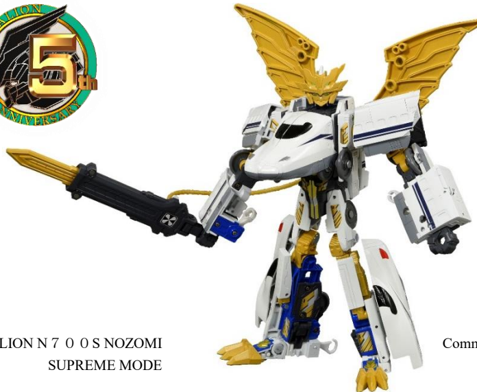
SHINKALION N 7 0 0 S NOZOMI SUPREME MODE