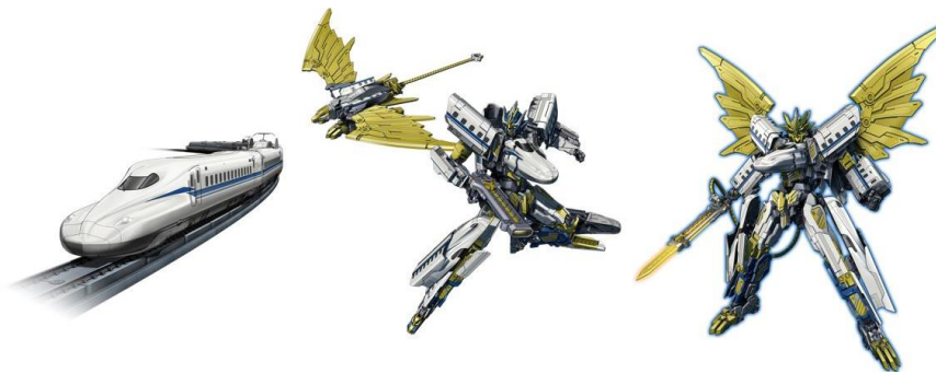
Design in the animation (from the left: SHINKANSEN MODE, SHINKALION MODE, and SUPREME MODE)