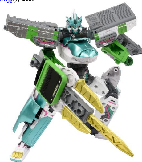
“SHINKALION Z E5 YAMANOTE,” after a “Z combination” of “SHINKALION Z E5 HAYABUSA” and “ZAILINER E235 YAMANOTE”