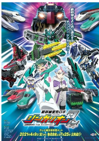
Main visual of the TV animation

As the first edition, TOMY Company will successively release a total of 10 items in the PLARAIL “SHINKALION Z” series, including “SHINKALION Z E5 HAYABUSA” (tentative price: JPY 5,280/tax included) and “ZAILINER E235 YAMANOTE” (tentative price: JPY 1,980/tax included), from April 2021 at toy stores, toy sections of department stores and mass retailers nationwide, online stores, specialty stores for PLARAIL products “PLARAIL Shops,” and TOMY Company’s official online store “Takara Tomy Mall” ( takaratomymall.jp ), etc.