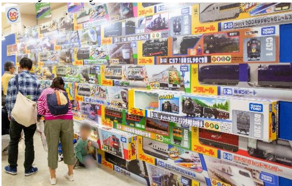
▲ The image is for visual representation purposes only

Enlarged PLARAIL packages make an appearance! Can you find your favorite PLARAIL?