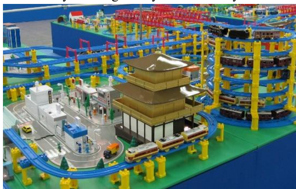
▲ The image is for visual representation purposes only

A fun diorama of PLARAIL running in West Japan♪ How many buildings that you know can you find?