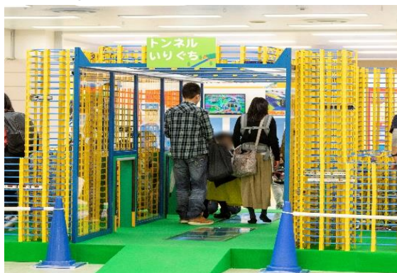
▲ The image is for visual representation purposes only

Humongous! PLARAIL tunnel makes an appearance! Go through the tunnel and take in the view of PLARAIL!