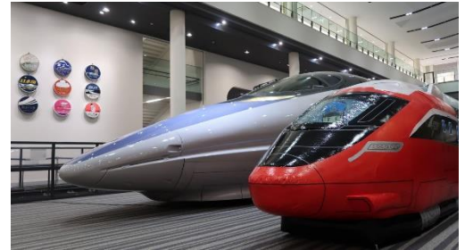
▲ The image is for visual representation purposes only

* Please note that the event period and location are different only for the exhibition of the large balloon model of “SPEEDJET.”