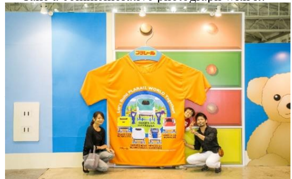
▲ The image is for visual representation purposes only

It's a giant PLARAIL T shirt! Take a commemorative photograph with it!