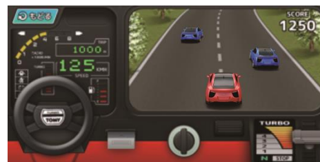
Image of the app