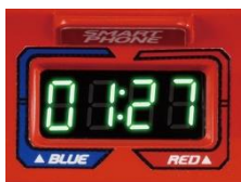
Lap time measurement