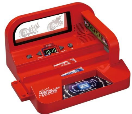
“TOMICA Speedway Play-by-Play Sound! Digital Accel Circuit” (JPY 4,950/tax included)

Tomy Company’s official online store “ Takara Tomy Mall ” original “Digital Lap Counter” will be released as a single item. Those who have “TOMICA Speedway Go! Go! Accel Circuit” (SRP: JPY 8,580/tax included) launched in 2019 can enjoy play similar to “TOMICA Speedway Play-by-Play Sound! Digital Accel Circuit” linked to the dedicated app, by using their circuit toy in combination with “Digital Lap Counter.”