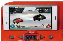
The app's CG image is linked to the situation of the race.