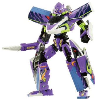
“SHINKALION Z 500 TYPE EVA”