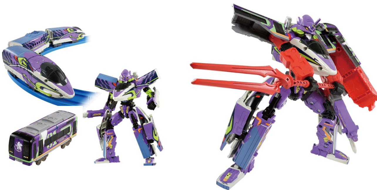
(Left) “Shinkansen 500 TYPE EVA” *tracks not included, “SHINKALION Z 500 TYPE EVA,” “ZAILINER μ SKY TYPE EVA” (Right) “SHINKALION Z 500 μ SKY TYPE EVA,” the “Z-combination” version with the “ZAILINER μ SKY TYPE EVA”