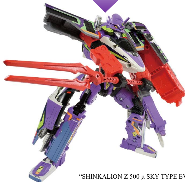
“SHINKALION Z 500 \mu SKY TYPE EVA”