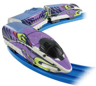
“Shinkansen 500 TYPE EVA” *Tracks not included.

The three-car “Shinkansen 500 TYPE EVA” changes into the SHINKALION MODE “SHINKALION Z 500 TYPE EVA!” And, by forming a “Z combination” with the “ZAILINER \mu SKY TYPE EVA,” part of the ZAILINER armor upgrading train series, the two toys transform into the “SHINKALION Z 500 \mu SKY TYPE EVA.”