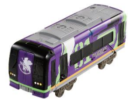
“ZAILINER \mu SKY TYPE EVA”