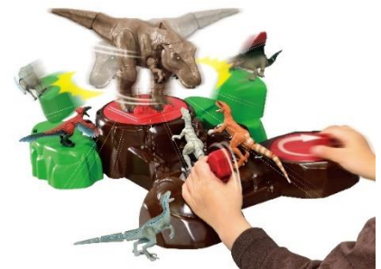
“ANIA Jurassic World: Wreak Havoc! The Strongest T. rex”

In addition, the entire group will release related toys such as PLARAIL that can be played with ANIA figures and a Pop-Up Pirate in the form of a T. rex, to boost dinosaur fever this summer along with the release of the movie for children and adults alike.