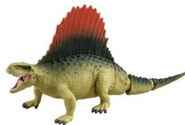
ANIA Jurassic World “Dimetrodon”