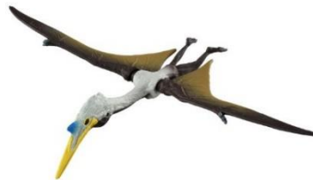
ANIA Jurassic World “Quetzalcoatlus”