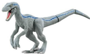
ANIA Jurassic World “Blue (snow ver.)”