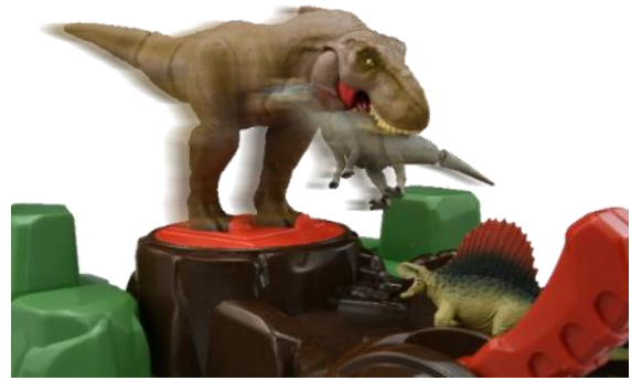
T. rex goes on a rampage with dynamic action, spinning around with ANIA figures and other items in its mouth

The T. rex’s head and tail, in tandem with its vigorous movement, can knock around and scatter dinosaurs, rocks, and other debris in its vicinity. To ensure that even small children can intuitively operate the T. rex, the lever simply moves back and forth and the hand wheel rotates left and right, in tandem with the T. rex’s movements. The giant T. rex can also be removed and held by hand to be played with as a figure, and the lever on its neck can be used to open its mouth and lift it up and hold other ANIA figures in its mouth.