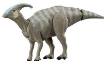
ANIA Jurassic World “Parasaurolophus”