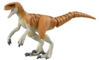
ANIA Jurassic World “Atrociraptor (Tiger)”