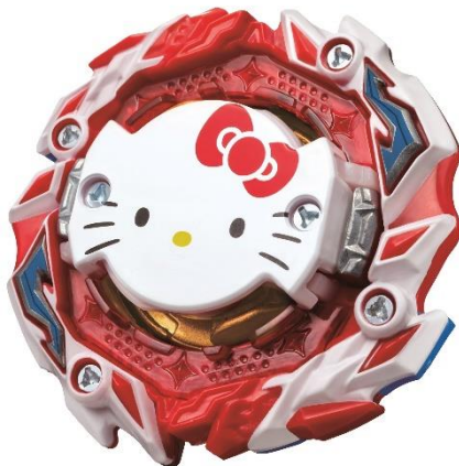
“B-00 Booster Astral Hello Kitty.Ov.R’-0”