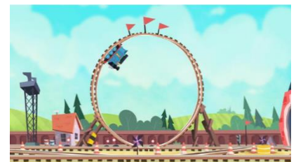
Loop-the-loop scene in the cartoon