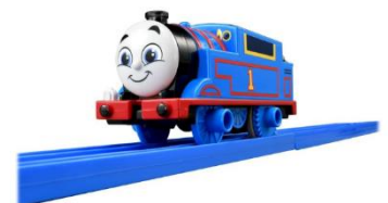
Go Go Thomas engine

Thomas the Tank Engine™ was created in the United Kingdom in 1945 and began airing as an animated TV series in Japan in 1990. This winter, thirty-two years after its original broadcast, NHK Educational TV will be airing a brand-new reboot. Since the broadcast of the first series in 1990, Thomas & Friends has used live-action model animation or 3D animation, and in rebooting the series hopes to reach audiences of an even wider range of ages and genders.