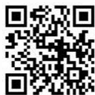
Video showing the product's loop-the-loop action