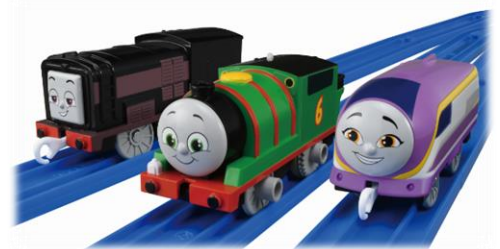
Go Go Thomas: Percy, Diesel, and Kana Friend Set