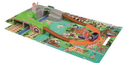
Go Go Thomas Portable 3D Map