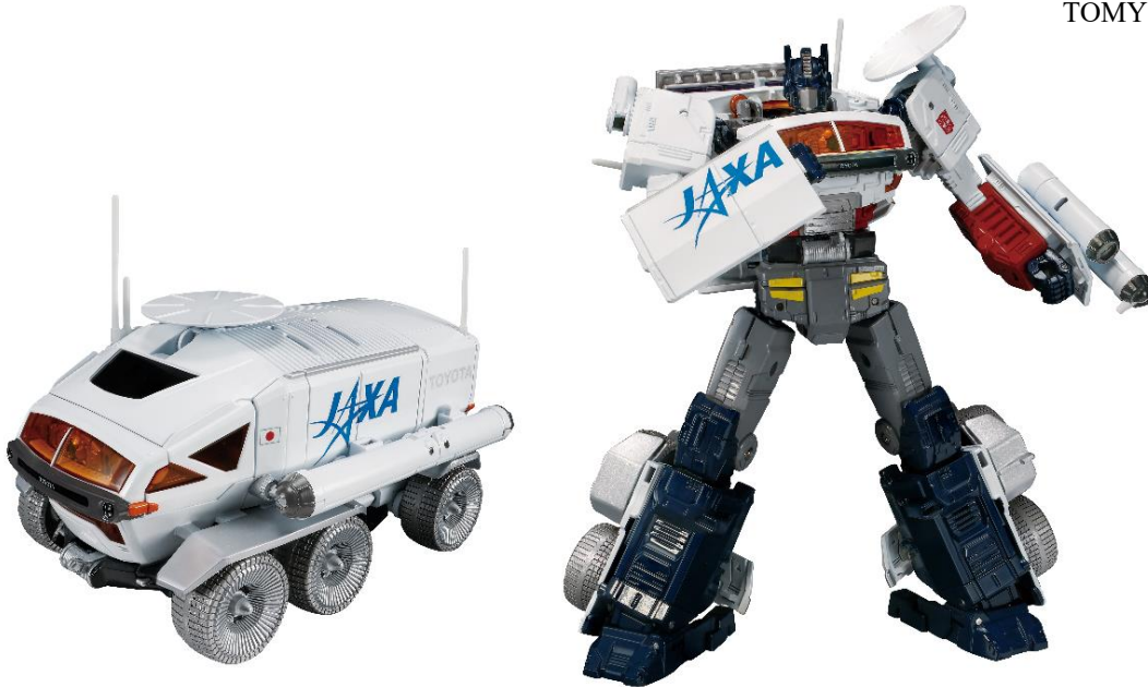
TRANSFORMERS “Lunar Cruiser Prime”