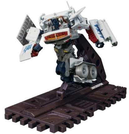
CAMPFIRE-exclusive bonuses! Set product with a display stand

* Sales through the crowdfunding site are available only in Japan.