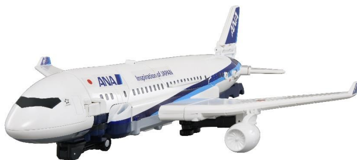
ANA Jetliner (before transformation)