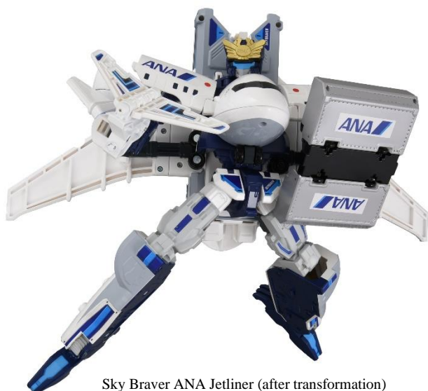
Sky Braver ANA Jetliner (after transformation)