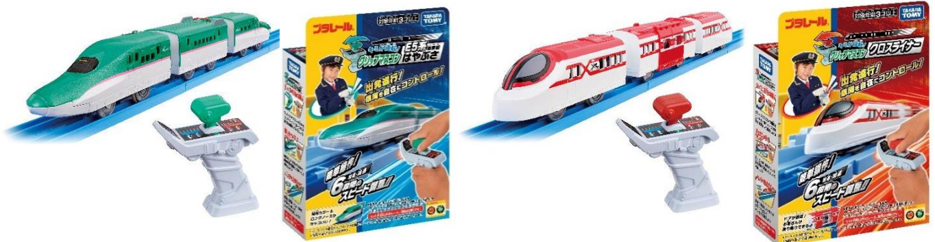
“You Drive! Grip-Type Master Controller Shinkansen Series

SRP: JPY 5,280 (tax included) Product size: Approx. W38 x H120 x D100 (mm) (Grip-Type Master Controller) Package contents: CROSS LINER (with Grip-type Master Controller IR Chassis) (1), Grip-Type Master Controller (1), Passenger block (1), middle car door (2), sticker (1) Copyright: © TOMY “PLARAIL” is a registered trademark of TOMY Company, Ltd.