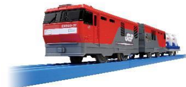
“S-25 EH500 Kintaro”

© TOMY Product commercialization licensed by JR East