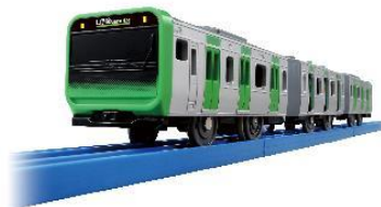
“S-32 E235 Yamanote Line (with Opening/Closing Doors)”

© TOMY Product commercialization licensed by JR East