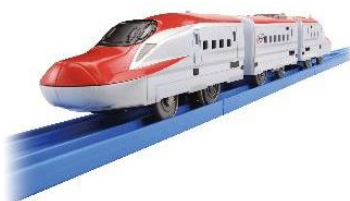
“S-14 E6 Series Shinkansen Komachi (with Magnetic Coupling)”

© TOMY Product commercialization licensed by JR East