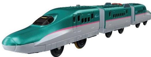
“Shinkansen Series E5

Exclusive colors are provided only for the “You Drive! Grip-Type Master Controller” series for both the “Shinkansen Series E5 Hayabusa” and “CROSS LINER” trains. The color of the “Shinkansen Series E5 Hayabusa” is a special specification true to the real-life Hayabusa. The color scheme even includes such details as the color of the driver’s seat. PLARAIL Railway (*) Commuter Super Express Train “CROSS LINER” is a train established to run on the new airport line, and the exclusive red color train is different from the product already on sale.