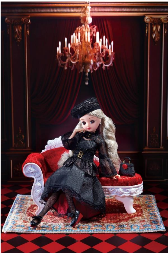
“Stylish Licca Photogenic Gothic Noir Style”

Stores taking pre-orders include four toy stores nationwide, Toy Store Yoshida (Asahikawa, Hokkaido), HAKUHINKAN TOY PARK Ginza Shop (Ginza, Tokyo), KIDDY LAND Harajuku (Harajuku, Tokyo), KIDDY LAND Osaka Umeda (Umeda, Osaka), as well as TOMY Company’s official online store “Takara Tomy Mall” ( takaratomymall.jp ).