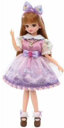
“LICCA the dreamer” On sale JPY 5,500 (tax included) *LICCA the dreamer gift set