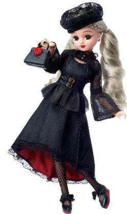
“Stylish Licca Photogenic Gothic Noir Style” To be launched in the middle of January 2024 JPY 13,200 (tax included)