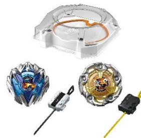
UX-04 BATTLE ENTRY SET U SRP: JPY 6,050 (tax included) (Scheduled for release on Saturday, April 27, 2024)