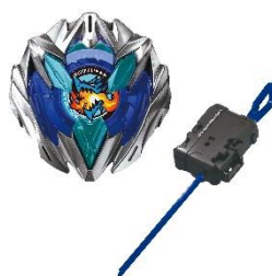
UX-01 STARTER DRANBUSTER 1-60A SRP: JPY 1,980 (tax included)

BEYBLADE X will adopt a new format, and BEYBLADE with unique characteristics such as “single-strike,” “smash,” and “centrifugal force” will be newly released on Saturday, March 30, 2024. We will also release products such as the STARTER, which includes a Beyblade (top) and launcher, and the BATTLE ENTRY SET, which includes a Beyblade (top), launcher, and stadium.