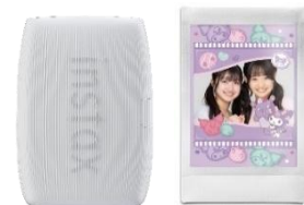
Printing with a smartphone printer in the instax™ Link series

*A separately sold smartphone printer instax™ Link series and instax™ film are required for printing.