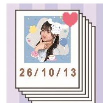
Calendar-based Photo Log Feature