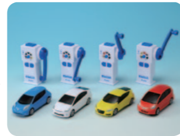
EDASH series of remote control vehicles that require no replaceable batteries.