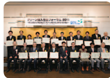
Winner of the Superiority Prize at the 13th Green Purchasing Awards