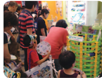
Environmental communications at events, etc.