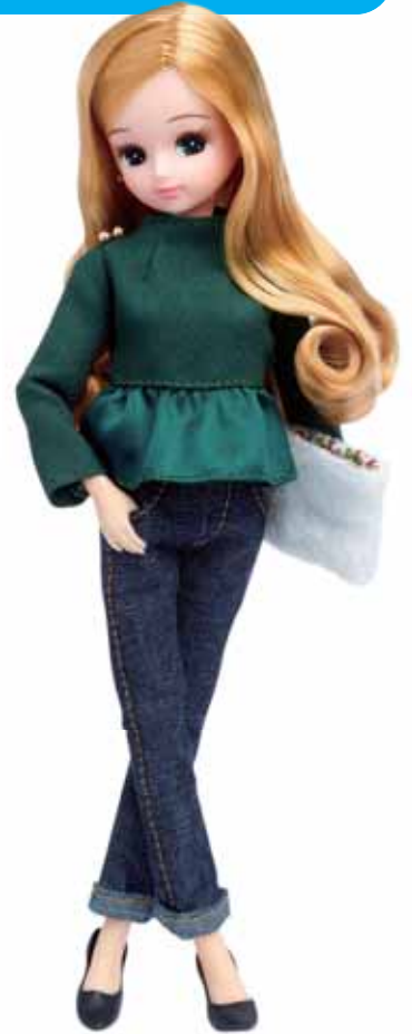
Licca Stylish Doll collections