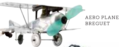
AERO PLANE BREGUET