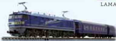
TOMIX JR東日本商品化許諾済