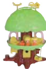
Koeda-Chan mini dolls