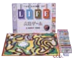
The Game Of Life