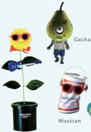
Rock 'n' Flowers