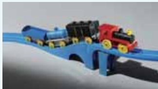
Plastic Train and Rail Set