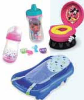
THE FIRST YEARS