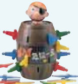
Pop Up Pirate