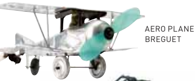
AERO PLANE BREGUET