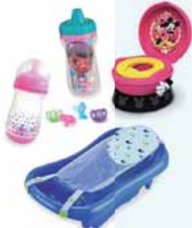
THE FIRST YEARS