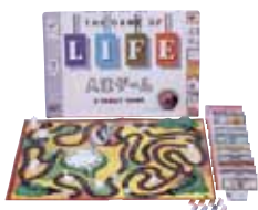
The Game Of Life