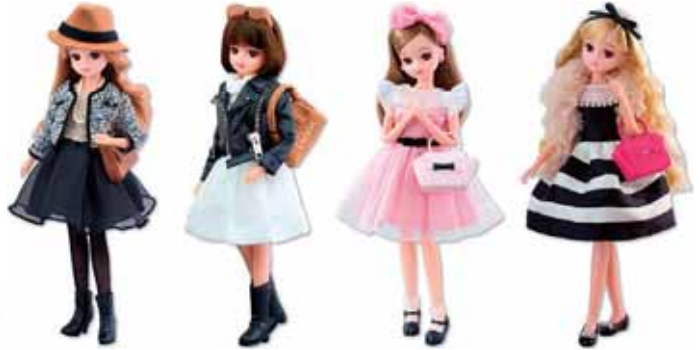
Licca Bijou Series