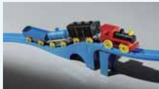
Plastic Train and Rail Set