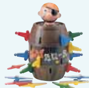
Pop Up Pirate