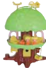
Koeda-Chan mini dolls