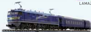
TOMIX JR東日本商品化許諾済