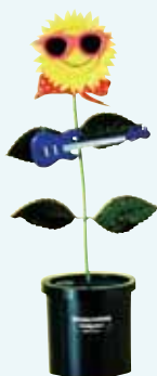
Rock 'n' Flowers