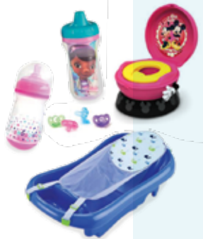
THE FIRST YEARS