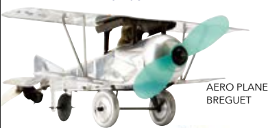
AERO PLANE BREGUET