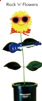
Rock 'n' Flowers