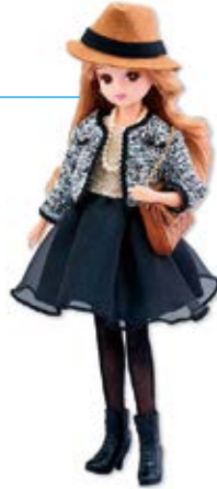
Licca Bijou Series