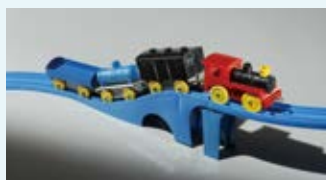
Plastic Train and Rail Set