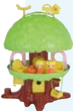
Koeda-Chan mini dolls