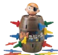
Pop Up Pirate