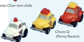
Choro-Q (Penny Racers)