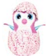
HATCHIMALS Umaretel Woomo