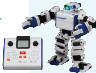
Omnibot 17μ i-SOBOT