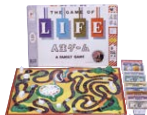
THE GAME OF LIFE