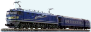
TOMIX Approved by East Japan Railway Company