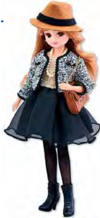
Licca Bijou Series