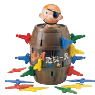
Pop Up Pirate