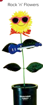
Rock 'n' Flowers