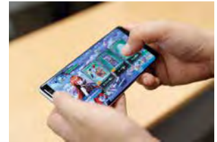
DUEL MASTERS PLAY'S