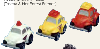
Choro-Q (Penny Racers)