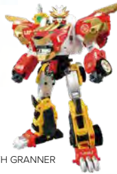
TOMICA EARTH GRANNER