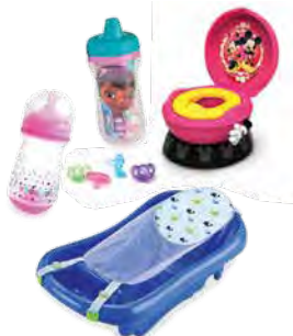
THE FIRST YEARS