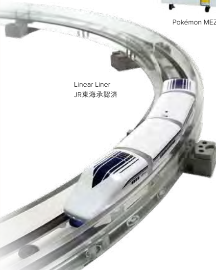
Linear Liner JR東海承認済