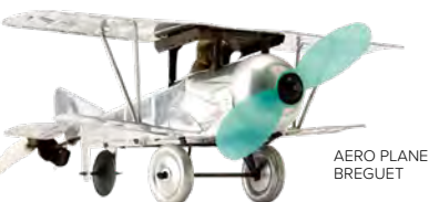
AERO PLANE BREGUET