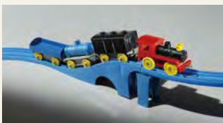
Plastic Train and Rail Set