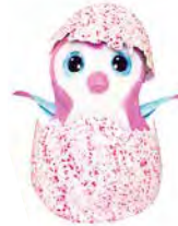
HATCHIMALS Umaret! Woomo