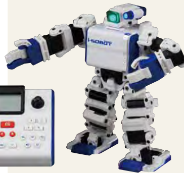
Omnibot 17μ i-SOBOT