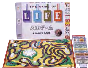
THE GAME OF LIFE