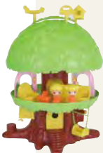
Koeda-Chan mini dolls (Treena & Her Forest Friends)