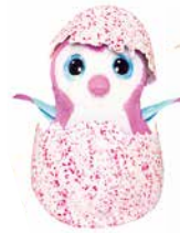
HATCHIMALS Umarete! Woomo