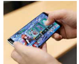
DUEL MASTERS PLAY'S