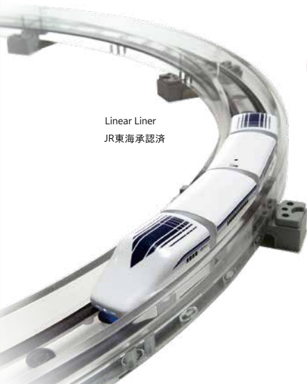
Linear Liner JR東海承認済