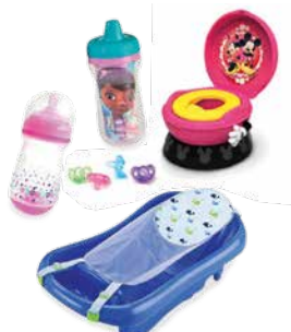
THE FIRST YEARS