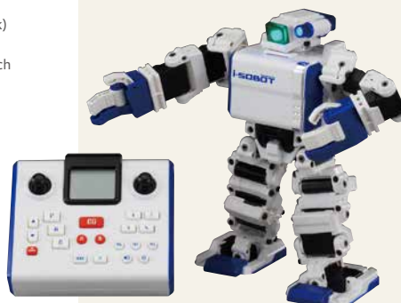
Omnibot 17μ i-SOBOT