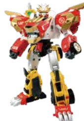
TOMICA EARTH GRANNER