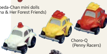
Choro-Q (Penny Racers)