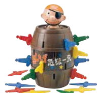
Pop Up Pirate