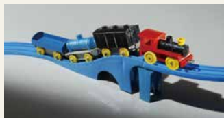
Plastic Train and Rail Set