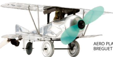
AERO PLANE BREGUET