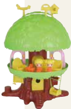
Koeda-Chan mini dolls (Treena & Her Forest Friends)