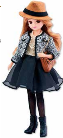
Licca Bijou Series