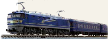
TOMIX Approved by East Japan Railway Company